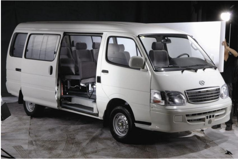
XMQ 6520 15 seats